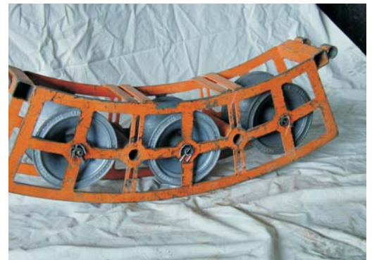
Short Curve Roller Set

This unit is used to assist cable running from the ground pit up to the surface with minimal strain