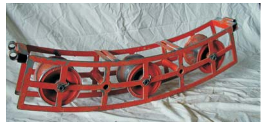
Long Curve Roller Set

Set at a 90° angle Also available on frame (as shown) for pulling directly out of the ground. Max cable dia 100mm.