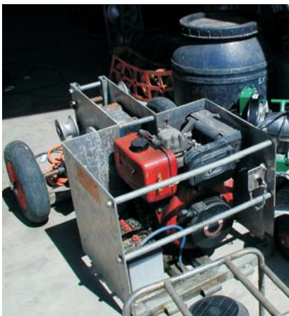
Diesel Winch Large 4 & 9 Hp

Both double capstan ½ Ton 4 HP 2 Ton 9 HP Complete with adjustable Guide roller, 'A' Frame & jerry can