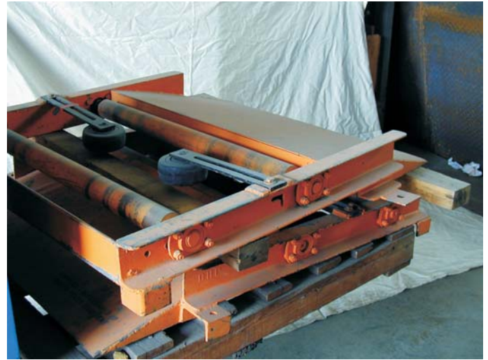
Flat Drum Stands

Max Drum width 1200mm Max Drum Dia 2700mm Max Wgt 6000 Kg 6T