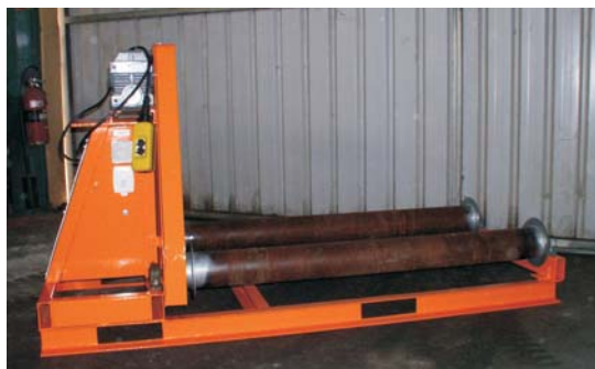
Motorised Cable Reeler

To sit against large cable drums to assist with drum roll