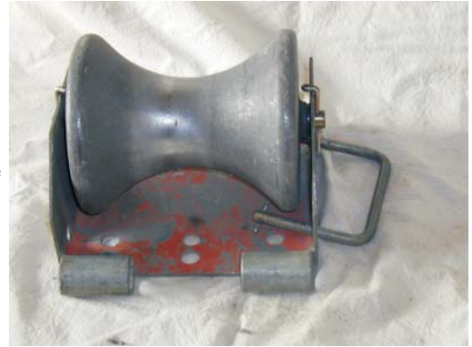
Dog Bone Hinged Roller Max cable width 200mm

* Variety of rollers available for a majority of your needs