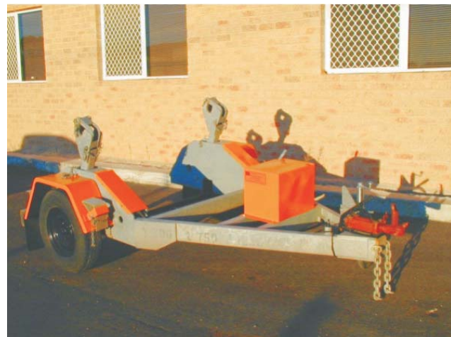
Small Cable Trailer

Wgt 5T Drum dia 2600mm Drum width 1308mm