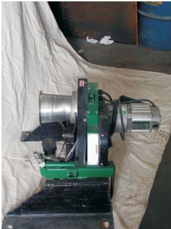
2900Kg Electric Portable Cable Winch

Both complete with ammeter Floor mounting/stand Vise chains Single Phase 15 Amps