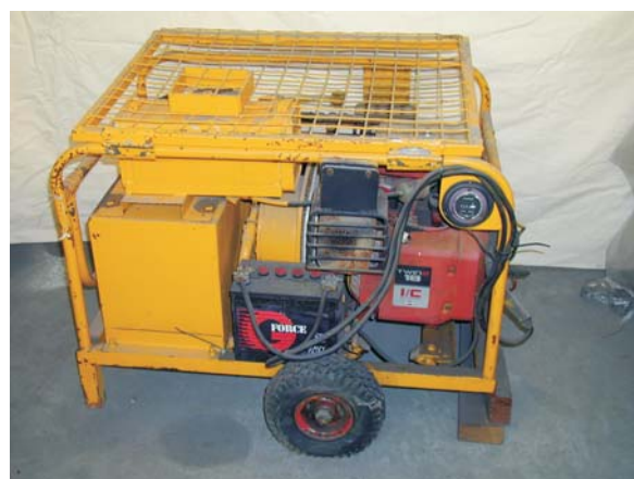
Heavy Duty Portable Petrol Hydraulic Powerpak

Available for use between hydraulic equipment and enerpaks