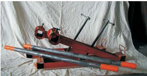
2T Height Adjusting Cable Drum Stand

* can be placed together for large drums Guide wheels lock drum into position.