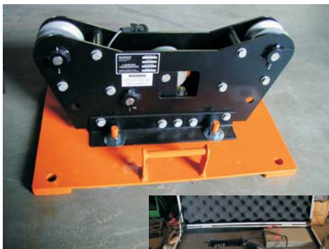
Cable haul Dynamometer to 5T in 1 kg increments with instrument control box