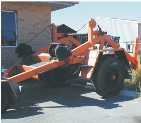
Large Cable Trailer 5Tonne (Hydraulic Brakes)

Wgt 5T Drum dia 2600mm Drum width 1308mm