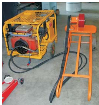
Hydraulic Drum Drive (Shown with 40L Hydraulic power pack)

Wgt 0.75T Drum dia 1500mm Drum width 1050mm