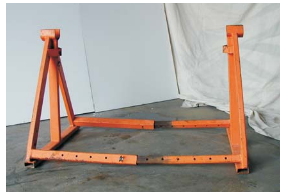
Adjustable A Frame

Max drum width 770mm Max drum dia 1040mm Max wgt 1T