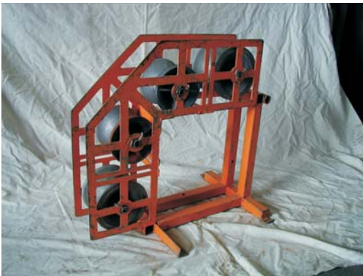
4 Corner Roller

Used to secure rollers & corners, also used to connect hinged rollers and additional rollers to corners & curves.