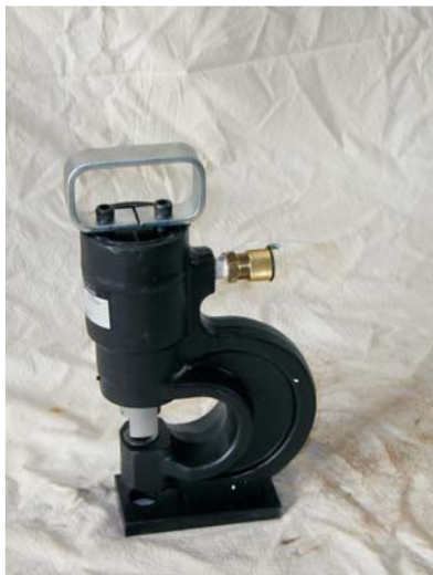
Hydraulic Punch Set Hole size: 10.5 To 20.5mm Capacity: 10mm Thickness