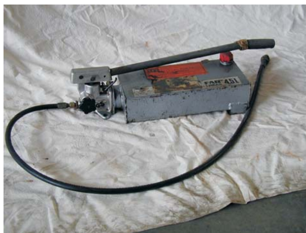
10T Hydraulic Hand Pump

Both for use with smaller hydraulic equipment