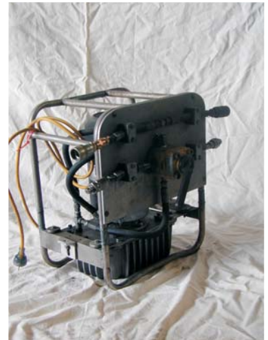
Electric 10T Hydraulic Powerpak

Ranging from 50mm hand cutter to heavy duty 7.5T cutter.