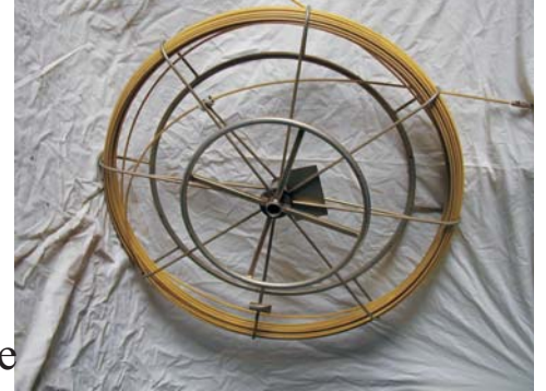
100 Metre Spool Snake