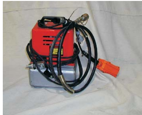
Electric Enerpack 10T

Ranging from 120mm hand crimper to heavy duty 630mm (30T) crimper