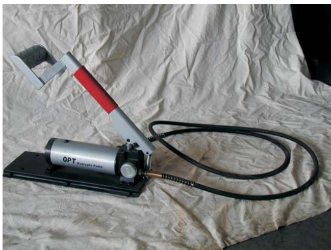
10T Hydraulic Foot Pump

Both for use with smaller hydraulic equipment