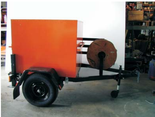
3.5 Tonne Winch Trailer c/w Tripod