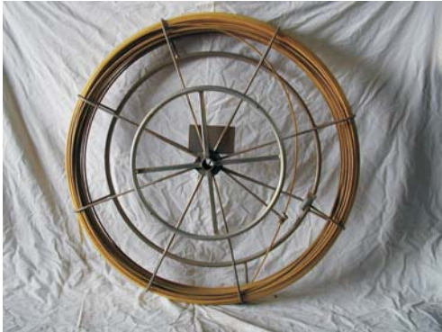
200 Metre Spool Snake