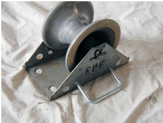
Standard Roller Max cable width 100mm