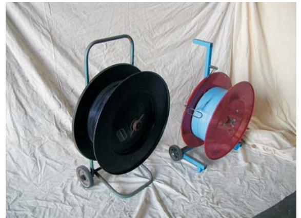
Blow Tape on Dispenser

Both double capstan ½ Ton 4 HP 2 Ton 9 HP Complete with adjustable Guide roller, 'A' Frame & jerry can