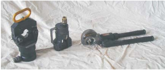
Assorted Crimping Sets c/w dies

Ranging from 120mm hand crimper to heavy duty 630mm (30T) crimper