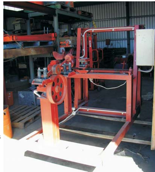
Small Recoiler with Drum or Hand Coil C/W Meterage Counter

8T Hydraulic or electric Used for reclaiming cable runs evenly back across drum