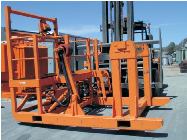
Cable Reclaimer Reeler Petrol or Electric

8T Hydraulic or electric Used for reclaiming cable runs evenly back across drum