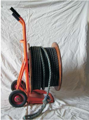
20mm Nylon Rope 3T 5 to 1 Ratio Eye slice each end on trolley