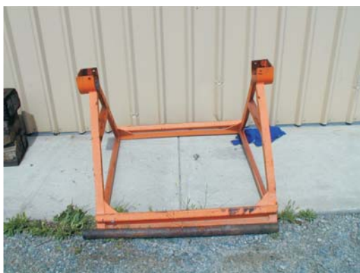
Small Cable Drum Stand

Max drum width 1500mm Max drum dia 2000mm Max wgt 3000 Kg 3T