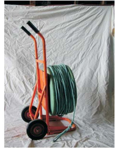
12mm Nylon Rope 1.5T 5 to 1 Ratio Eye slice each end on trolley