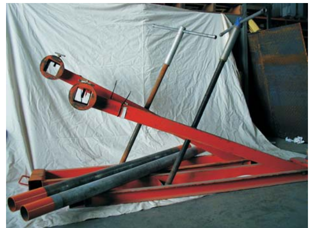
3T Height Adjusting Cable Drum Jacks

Max drum width 1000mm Max Drum Dia 1500mm Max Wgt 2000 Kg 2T