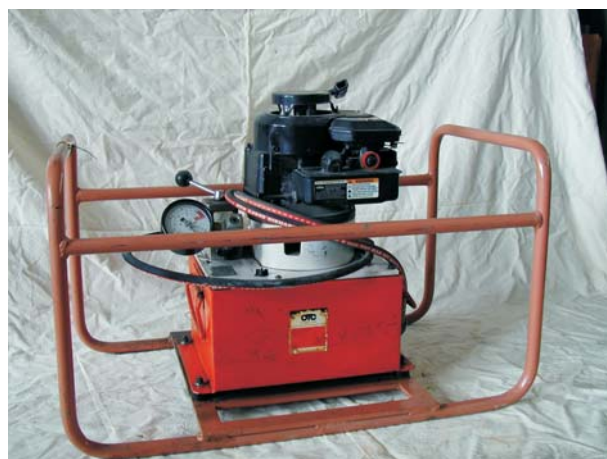
Petrol 10T Hydraulic Powerpak

This unit is a power source for the larger hydraulic equipment