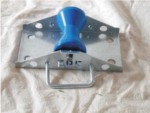
Flat Tray Roller Max cable width 100mm

* Variety of rollers available for a majority of your needs