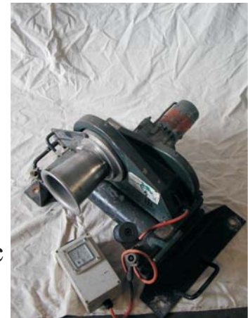
1800Kg Electric Portable Cable Winch

Both complete with ammeter Floor mounting/stand Vise chains Single Phase 15 Amps