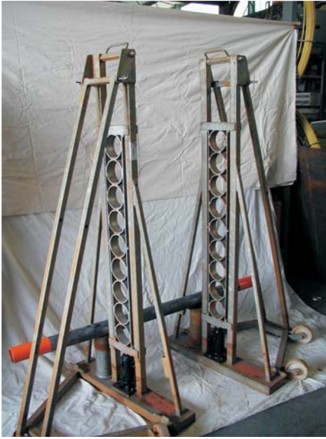
6T Cable Drum Jacks

Max Drum width 1200mm Max Drum Dia 2700mm Max Wgt 6000 Kg 6T